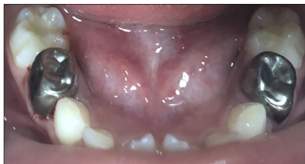
Figure 3. Intraoral occlusal view showing stainless steel crown placed on bilateral primary mandibular first molars

There are several non-surgical options for treating this non-cavitated carious lesion on these bilateral mandibular first primary molars. Non-surgical treatment options include the use of silver diamine fluoride (SDF) and resin infiltration. The reported success rate